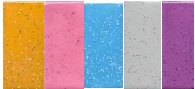
SP-205 Speckled Tiger Tail SP-270 Speckled Pink-A-Dot SP-211 Speckled Blue Yonder SP-260 Speckled Silver Lining SP-213 Speckled Grapel

Follow the leader and check out our hot new Speckled Stroke & Coat colors. Step on over to the best selling bisque glaze product on the market. It's the Stroke & Coat you know and love, but with tiny speckles added. Speckled Stroke & Coats are color coordinated to go with your favorite Stroke & Coat colors. Use Speckled Stroke & Coat to add interest and variety to flower petals or any kind of design. Stroke & Coat truly is the Wonderglaze for Bisque.